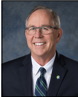
Mayor Steve Callaway