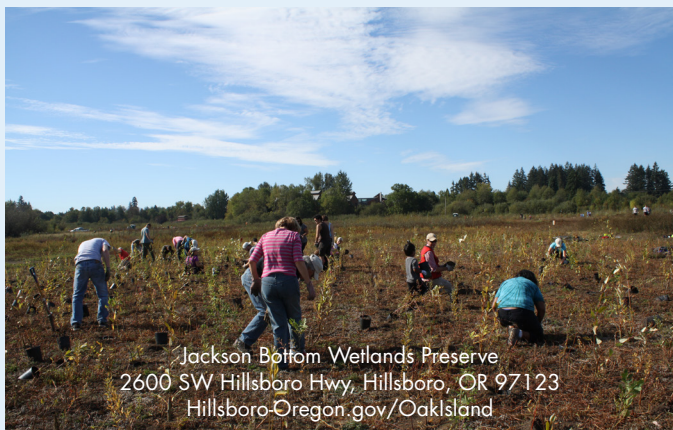
Jackson Bottom Wetlands Preserve 2600 SW Hillsboro Hwy, Hillsboro, OR 97123 Hillsboro-Oregon.gov/OakIsland

Jackson Bottom also has a robust Citizen Science program. These volunteers collect and report bird monitoring data. Continued bird monitoring will track the success of the restoration project.