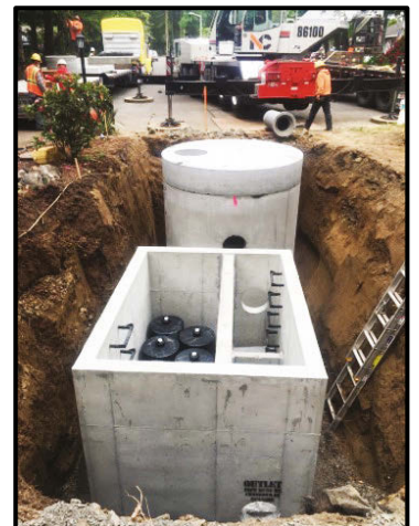
Water Quality Filter Vault